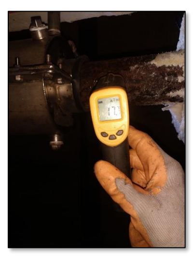
Measure pipeline temperature during the entire pipe freezing process