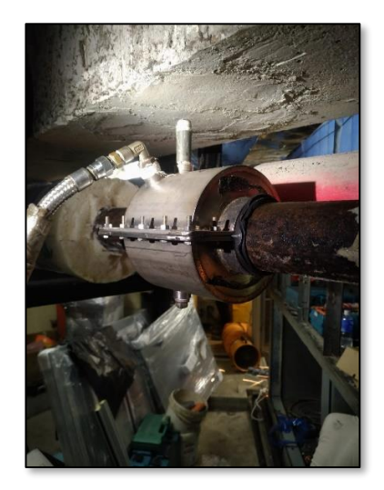
Installation of pipe freezing jacket at proposed location

After our on-site assessment and evaluation, the pipe freezing location was fixed. Non-destructive Ultrasonic flow measurement test was conducted to ensure the there was no water flow in that section of pipeline first.