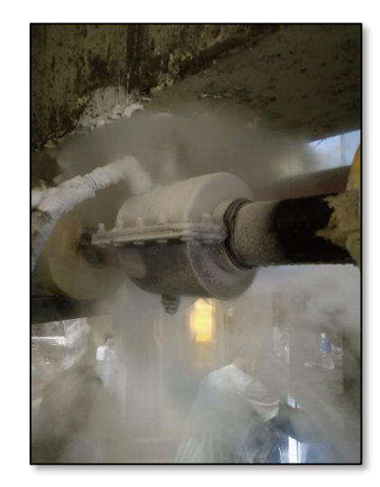
Pipe Freezing at proposed location

After the test, install the pipe freezing clamp on that section of pipe and connect it to Nitrogen cylinders. Our specialists will keep monitor the temperature profile change in entire process. Hot work and valve replacement work can be carry out after our specialists confirmed the ice-plug was formed successfully. While the replacement of valve was done, our specialist will remove the pipe freezing clamp and let the ice plug defrost by natural.